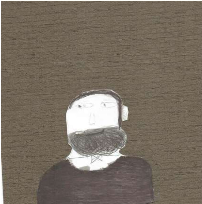
Artwork from Across An Open Field: Stories and artwork by children from Ireland and Northern Ireland about the Decade of Commemorations 1912-1922