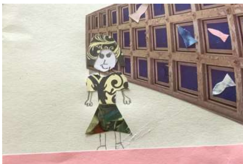
Artwork created by members of the Visual Thinking Team, Summer 2020