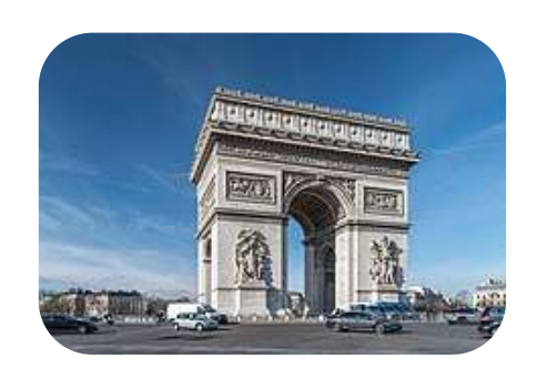
Arc de Triomphe Paris

When you are in a city, a town, a castle or a garden, you can find buildings in the shape of an arch. You can walk, cycle or drive through them. There is a famous one in the centre of Paris: the Arch the Triomphe. There is an arch drawn on the five Euro note. Sligo abbey has a wall with arches. You might be able to find some in the area where you live.