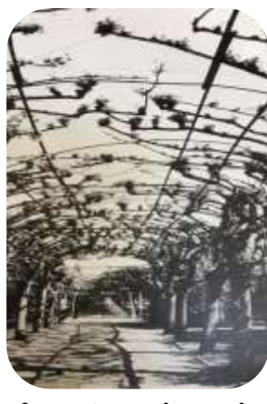
A natural arch