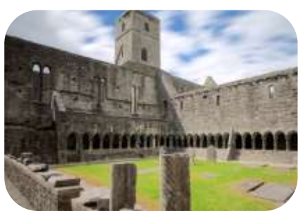
Arched wall in Sligo Abbey