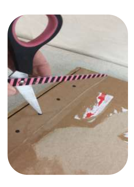
2. Mark holes in cardboard box you are using as a base and use a scissors to punch the holes