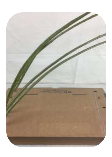
3. Put the sticks in the holes on one side and tape them securely to the box