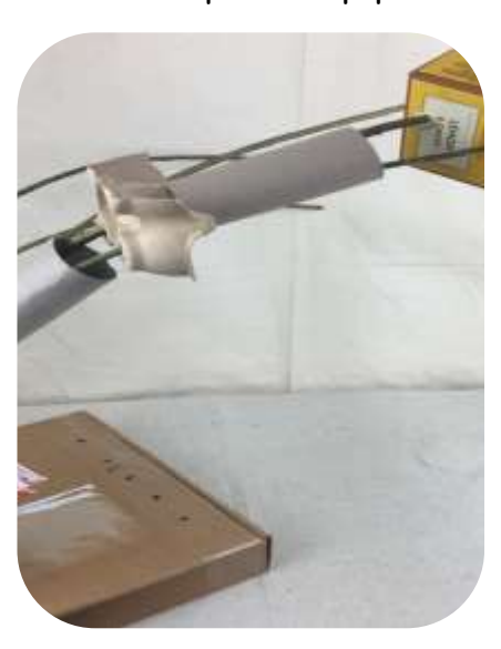
4. String together boxes, toilet rolls, plant pots on two sticks, put the sticks in the holes on other side of base box and tape it together. Do the same with the last 2 sticks. You can leave one empty in the middle