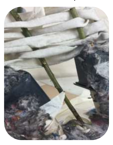
5. Weave the roof with wool, fabric string or rope