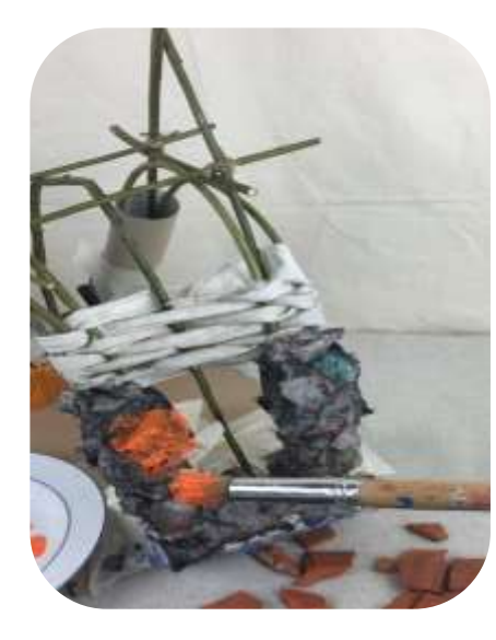
6. Decorate with paint, paper mache and mozaik from plant pots